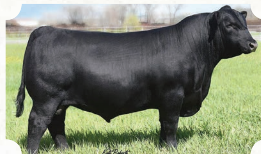
MUSGRAVE 316 STUNNER - SERVICE SIRE

• Was one of the most popular bulls offered by Genex.