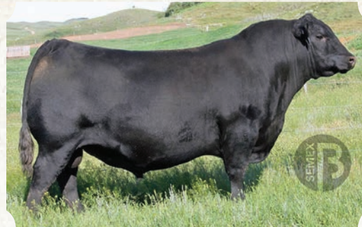
MUSGRAVE 316 COLOSSAL - SERVICE SIRE